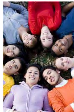
Raising Healthy Families Introducing the Bright Futures Family Network!

In this issue of Bright Futures Family Matters , we'll introduce you to the BFFN members. Check them out!